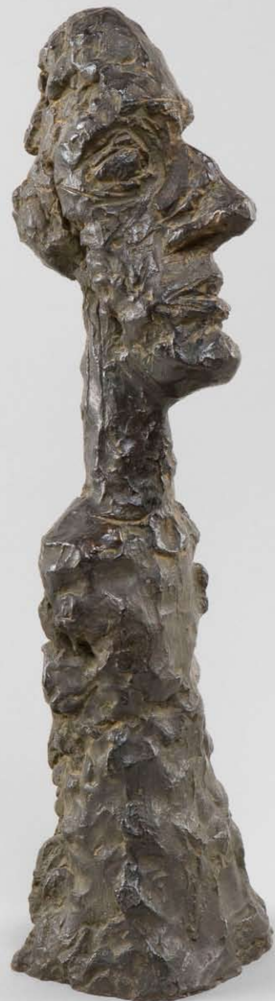
Head with a Large Nose, 1958