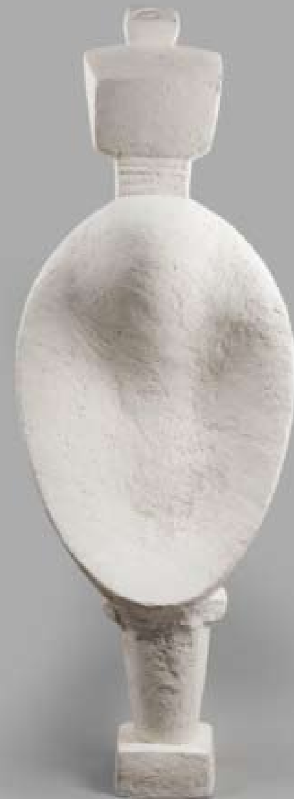
emme cuillere, 1927