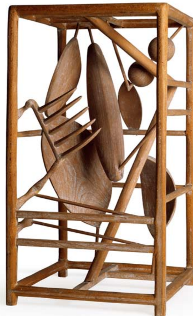
cage 1930, 1931