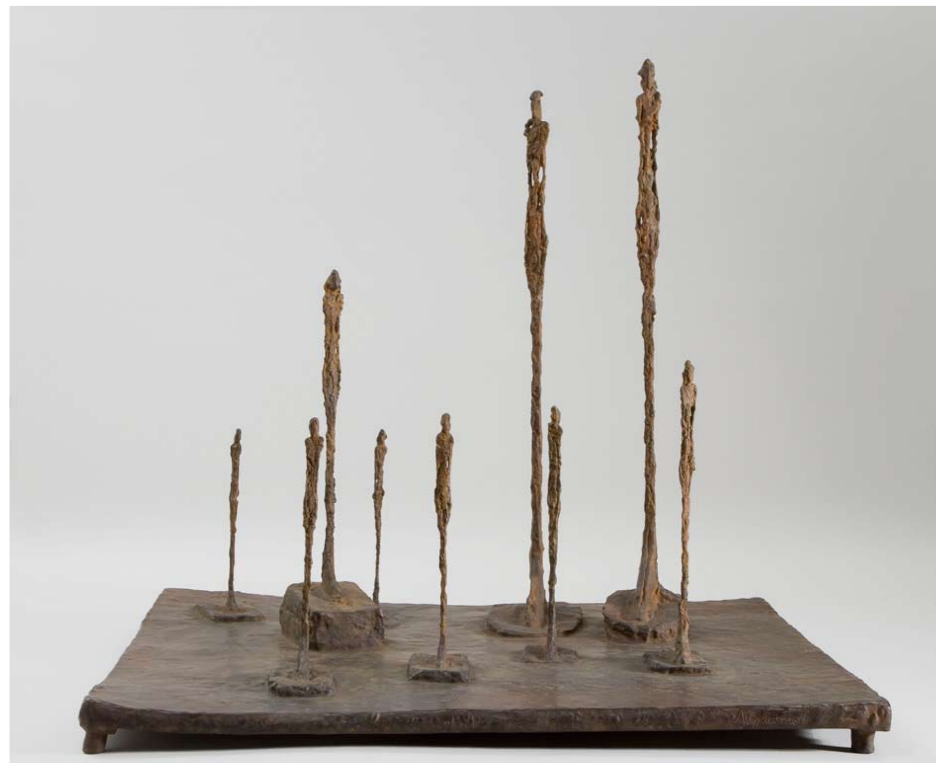
La Clairière, 1950