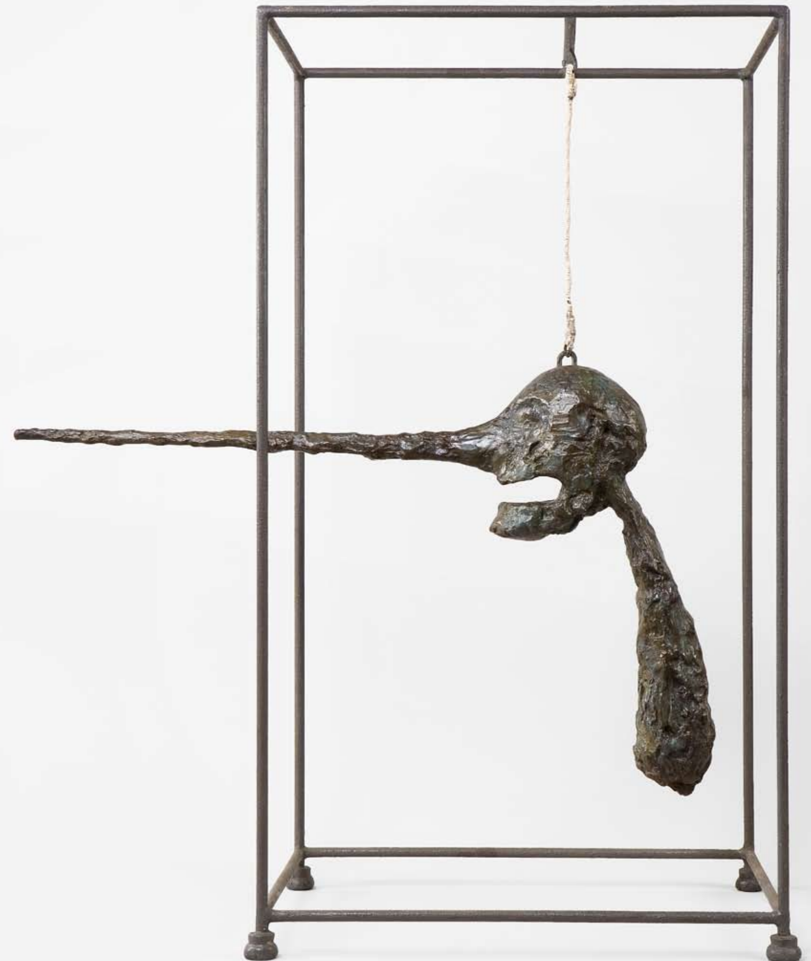
lenez 1947, 1949